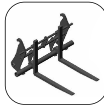
Forks Mounted on Quick Coupler